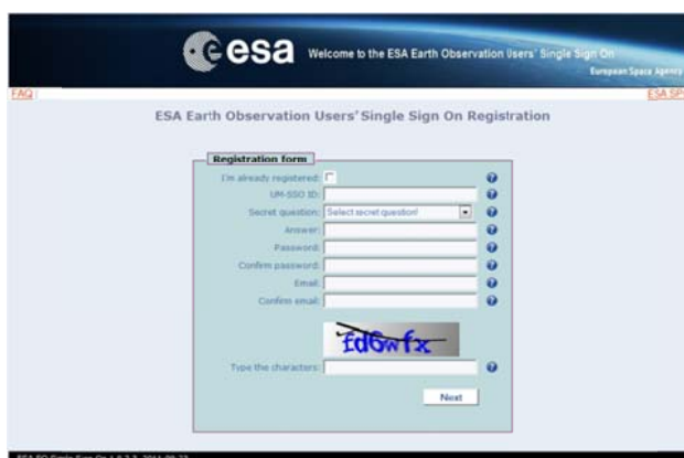
Figure 2: ESA EO-SSO interface

In case you are not registered to Earthnet, please select the button Register: this will lead you to the ESA EO-SSO registration area (see Figure 2), where you will be requested to define username, password and to provide your Email address.