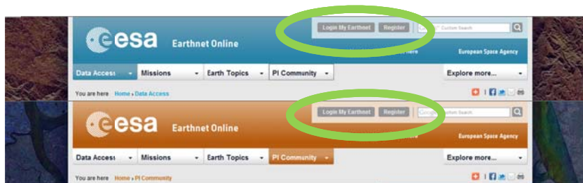
Figure 1: Login My Earthnet and Registration buttons in two different pages of EO-DISP

A pre-requisite to access the Submission area is to be logged-in to My Earthnet (see Figure 1).