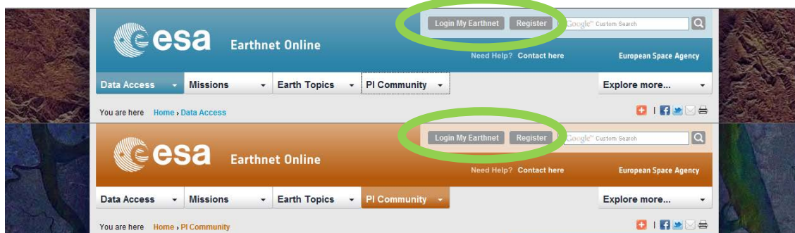
Figure 1: Login My Earthnet and Registration buttons in two different pages of EO-DISP

A pre-requisite to access the Submission area is to be logged-in to My Earthnet (see Figure 1).