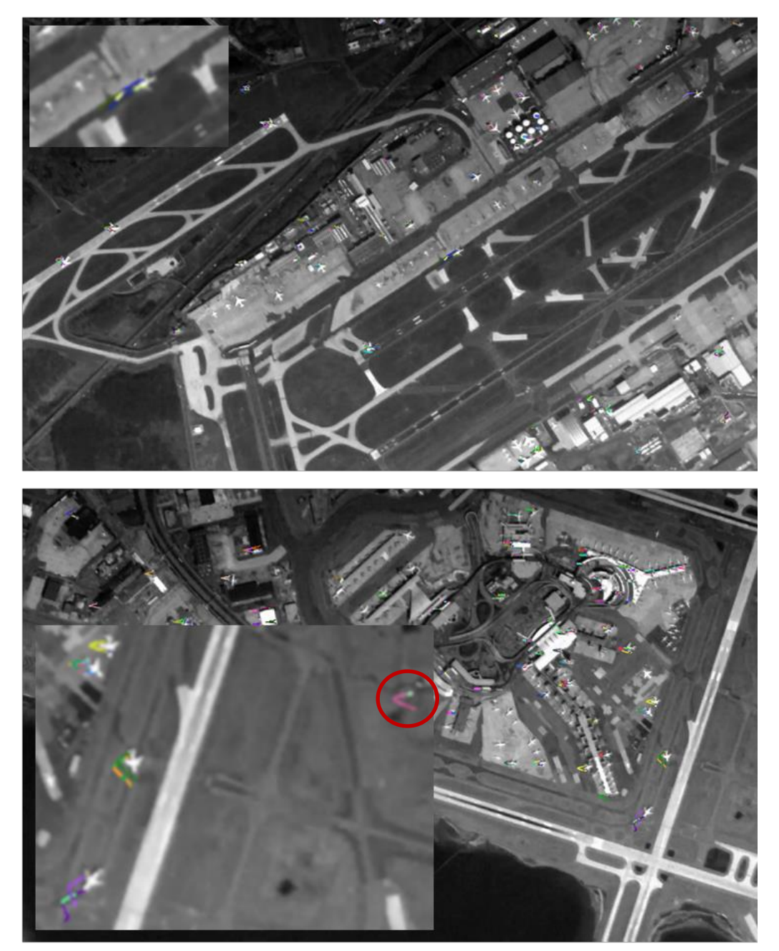
Figure 4-3: Plane tracking for Frankfurt (top) and New York (bottom). For New York, the zoomed in area shows the tracks in more detail for some of the objects.

runway and its tracks. This track shows both the movement of the aircraft and any shift in the central location of the video (i.e., where the video is physically pointing at).