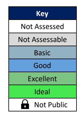
Figure 1 - Summary Cal/Val Maturity Matrix and Key. To be colour-coded to report results of assessment.