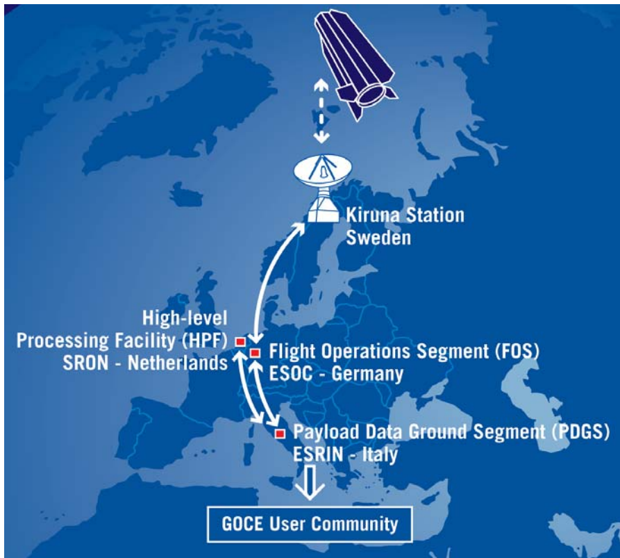
GOCE mission ground segment elements and inter-relations