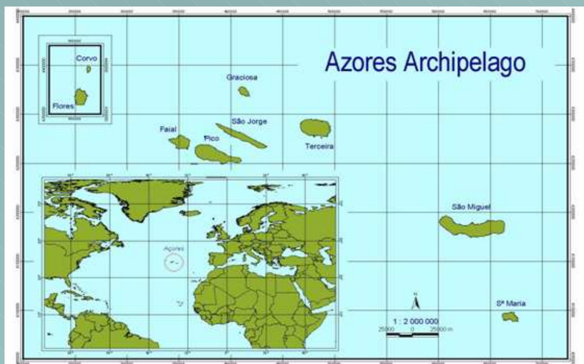
FIGURE 1 – Azores Archipelago location