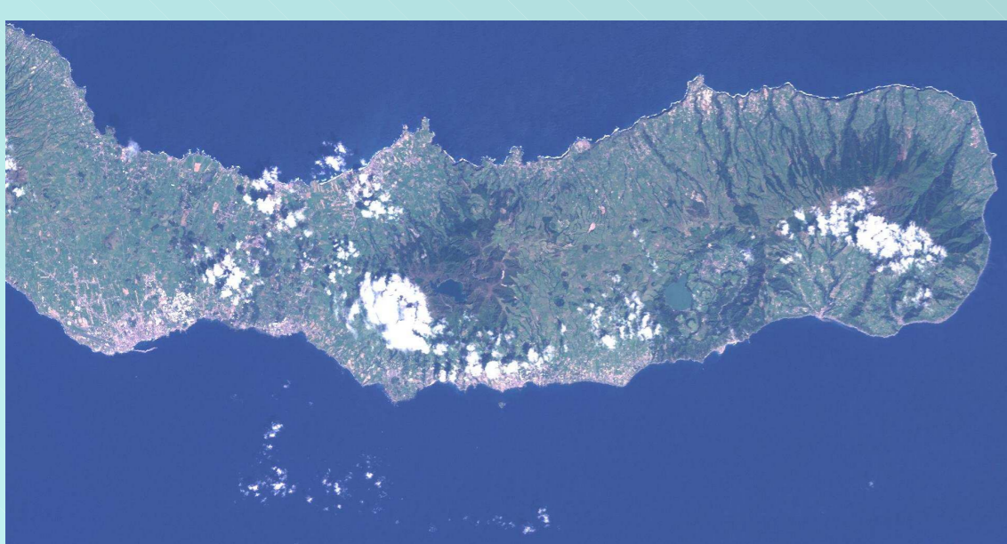
FIGURE 4 – Landsat 7 ETM+ Image (True-Color Composition): S. Miguel Island (EarthSat, 2001)