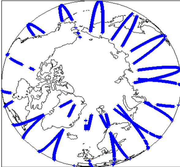
Global Coverage (north pole view)