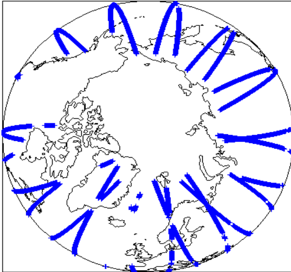
Global Coverage (north pole view)